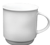
STACKING MUG 0.26 Ltr AG 88810