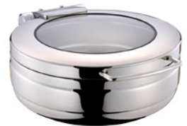
Round Chafing Dish 4 L Glass lid