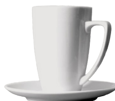
LATTE CUP TALL 0.30 Ltr AG 89904 SAUCER 15cm AG 89905