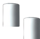
ROUND SALT SHAKER 6cm (h) x 4cm (d) AG 86030