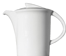
OVAL COFFEE POT - BASE 0.30 Ltr AG 84230 LID FOR OVAL COFFEE POT AG 84231