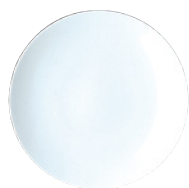
ROUND FLAT COUPE PLATE 9cm AG 80309 10.5cm AG 80310 15.5cm AG 80315 17.5cm AG 80317 20.5cm AG 80320 23cm AG 80323 25.5cm AG 80325 30.5cm AG 80330 32cm AG 80332 35cm AG 80335 39.5cm AG 80339 45cm AG 80345 50cm AG 80350