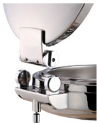
Removable Lid Easy cleaning and storage