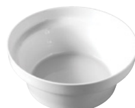
ROUND DEEP BUFFET BOWL 29cm / 4 Ltr AG 88303