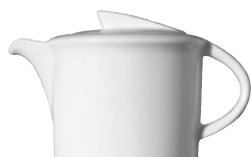
OVAL TEA POT - BASE 0.35 Ltr AG 84335 LID FOR OVAL TEA POT AG 84336