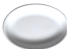
OVAL DEEP COUPE PLATTER 24cm x 16cm AG 83924 28cm x 18.5cm AG 83928 33cm x 23.5cm AG 83933 50cm x 35cm AG 83950 56cm x 42cm AG 83956