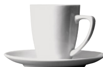
CAFFE CUP 0.20 Ltr AG 89903 SAUCER 15cm AG 89905