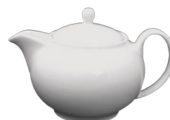
ROUND COFFEE POT - BASE 0.35 Ltr AG 85435 LID FOR ROUND COFFEE POT AG 85436