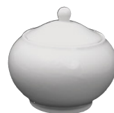
ROUND SUGAR BOWL - BASE 9cm AG 85709 LID FOR ROUND SUGAR BOWL AG 85710