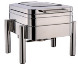
1/2 Chafing Dish Glass lid, on stand