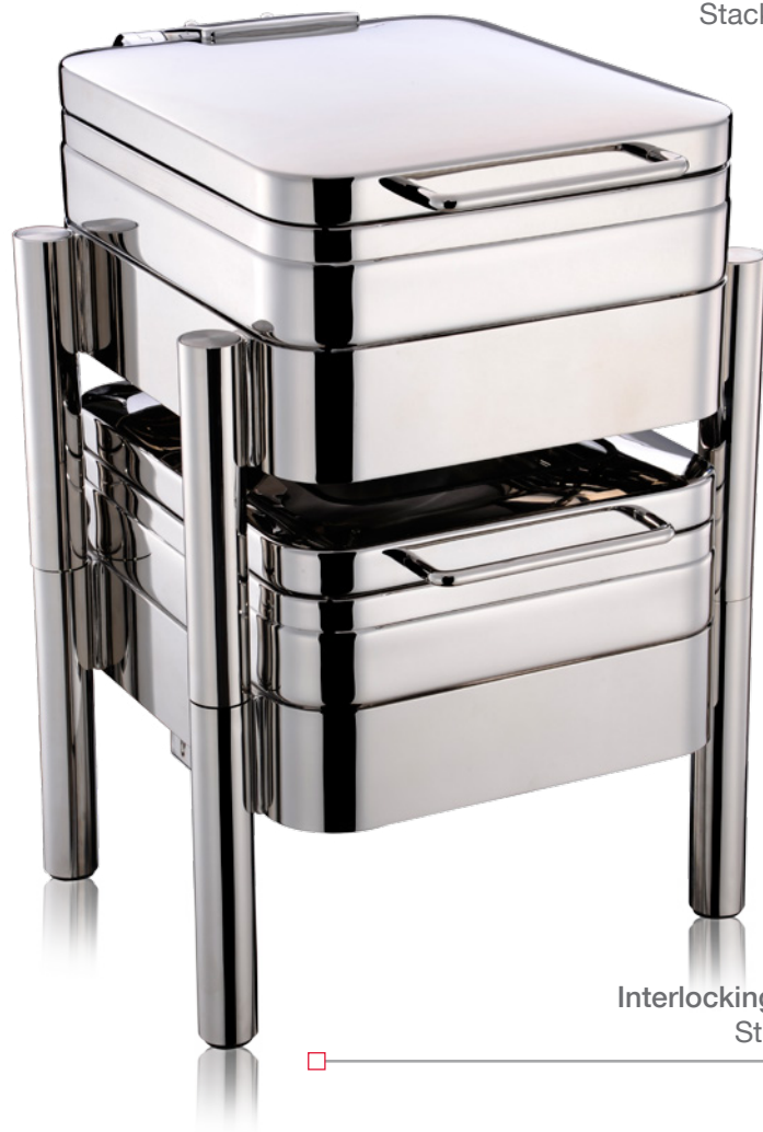
1/2 Chafing Dish Stacked for storage