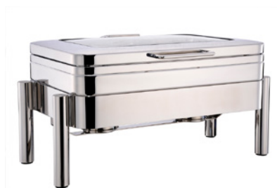
1/1 Chafing Dish Glass lid, on stand