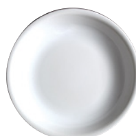
ROUND DEEP COUPE PLATE 16cm AG 89016 18cm AG 89018 21cm AG 89021 25.5cm AG 89025 30.5cm AG 89030 32cm AG 89032 35cm AG 89035 40.5cm AG 89040 46cm AG 89046