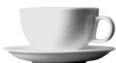
TEA / CAPPUCCINO CUP 0.27 Ltr AG 87704 SAUCER 15cm AG 89905