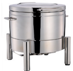
Buffet Soup Server Glass lid, on stand