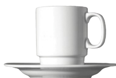
STACKING COFFEE MUG 0.22 Ltr AG 88809 0.25 Ltr AG 88805 0.30 Ltr AG 88808 SAUCER 16cm AG 88807