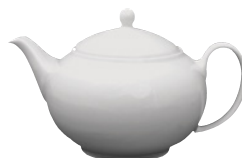
ROUND TEA POT - BASE 0.60 Ltr AG 85260 LID FOR ROUND TEA POT AG 85261