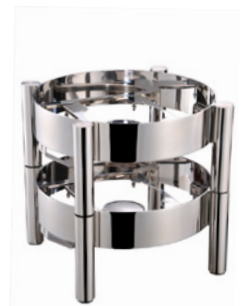
Stackable Stand Design